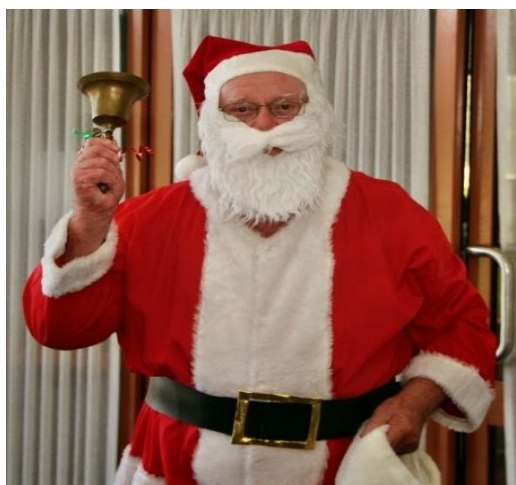
Back In History - Christmas Lunch 2014